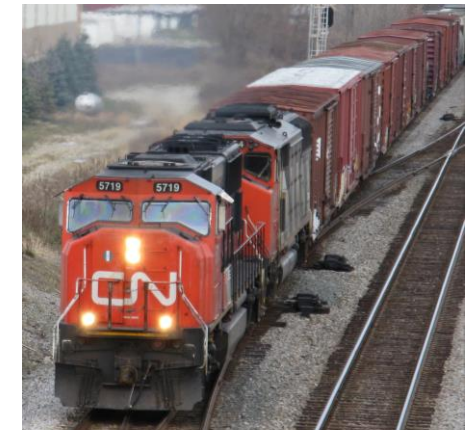
Railway Waste Heat Recovery