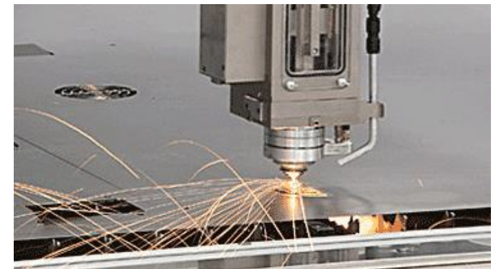
Machine Tool Spindles