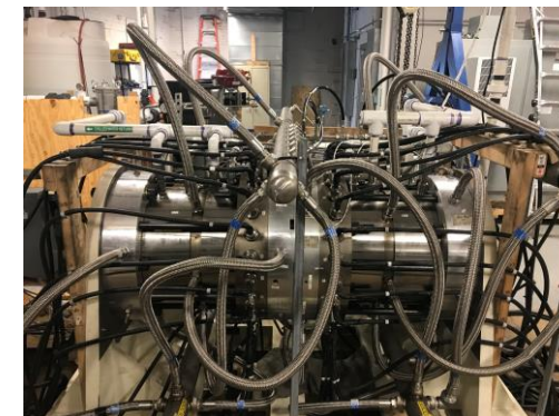
Power Generation Dual 1.6MW Systems, 25K RPM